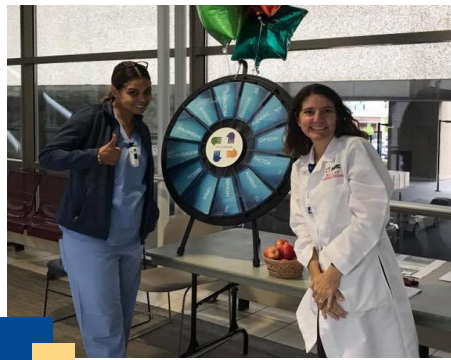
HCMC staff stand by the “wheel of confusion” during a Health Literacy Month event.