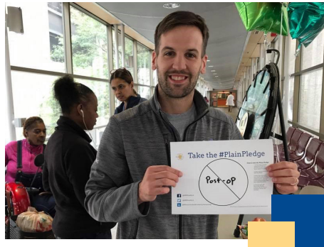
People took the plain pledge to stop using words that are difficult to understand and instead use plain language.

HCMC has also started to use the software when training nurse residents to help them better understand health literacy and its importance to patient health.