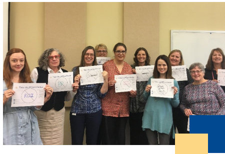
Members of the Minnesota Health Literacy Partnership display their plain pledges. Thanks to everyone who got involved and took the pledge!

The PowerPoint presentations explain plain language, clear